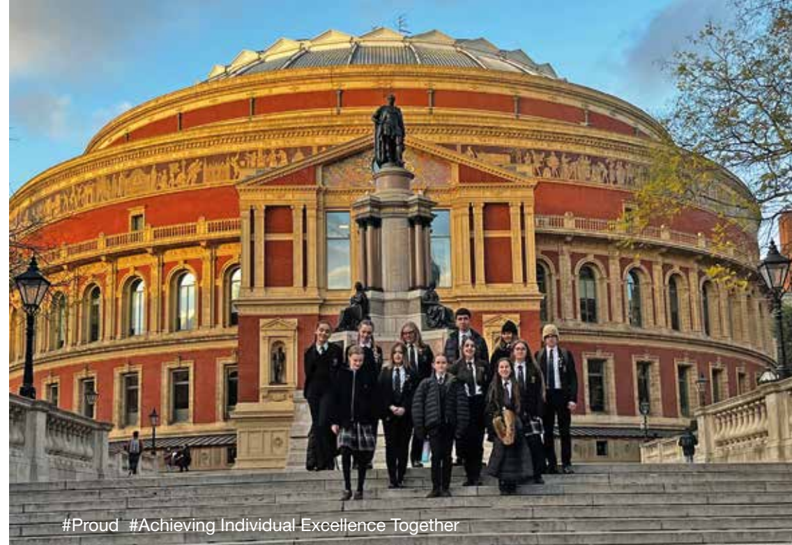
#Proud #Achieving Individual Excellence Together

We are so proud to announce that 12 of our student choir, Year 7 to Year 11, have had the honour of performing in a mass choir event at The Royal Albert Hall. The students performed with The Royal Philharmonic Orchestra in aid of Bernardo's Children's Charity .