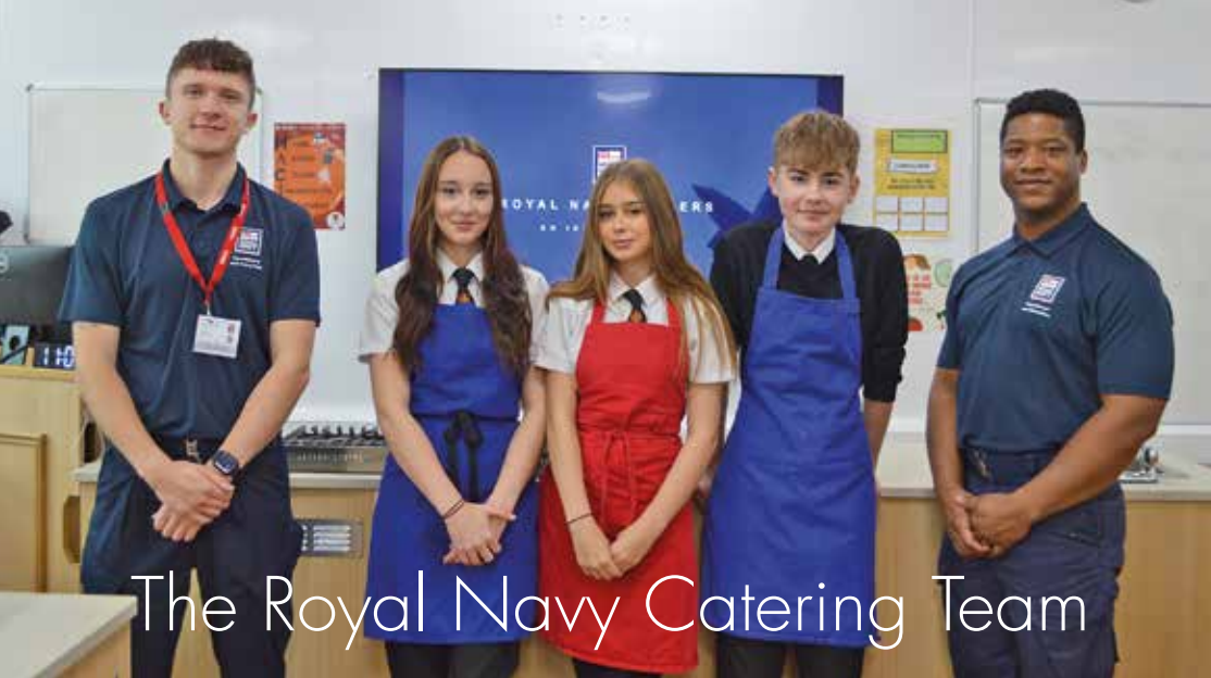
The Royal Navy Catering Team